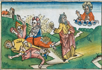
A medieval picture showing the importance of religion in medieval medicine

SCIENTIFIC METHOD - some early pioneers of scientific method from Bishop Grosseteste & John of Arderne (observe and record). But any disagreements with the Church ended up in execution e.g. Roger Bacon (13th century)