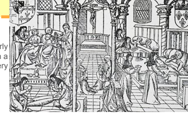
Early hospital in a monastery