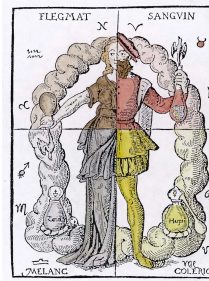
A symbol of the 4 Humours